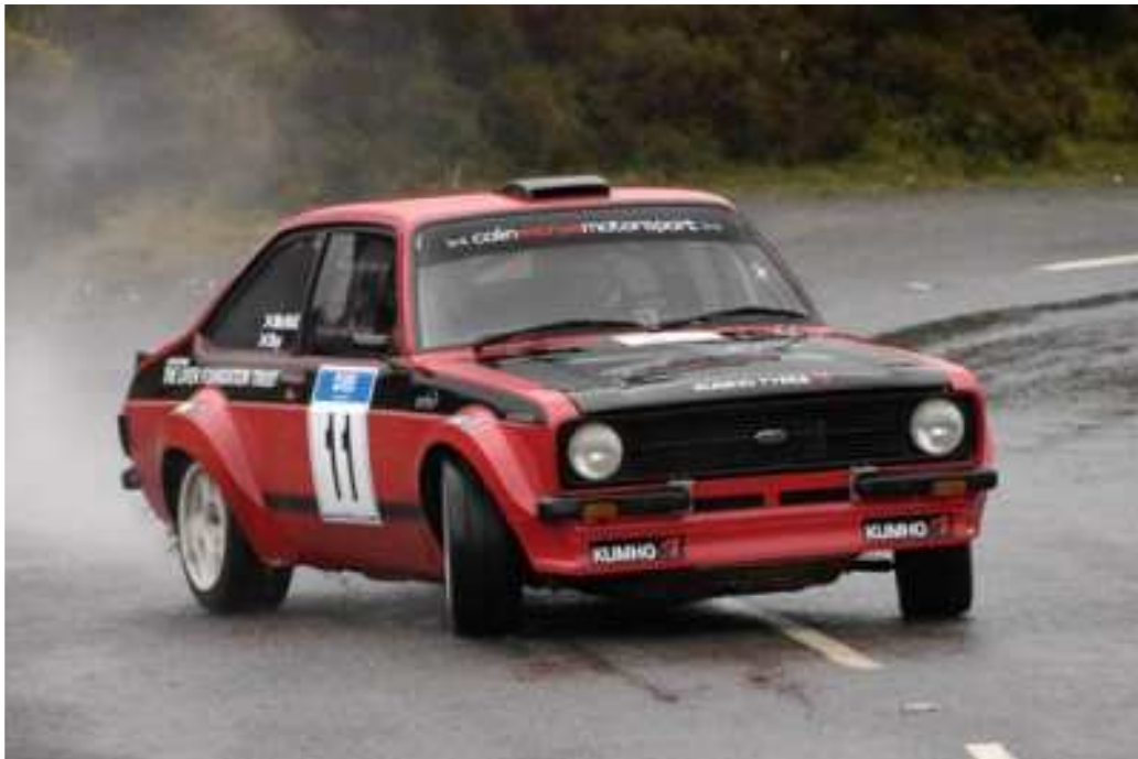
Colin McCrae's Ford Escort at the recent McCrae Stages Rally in Scotland.