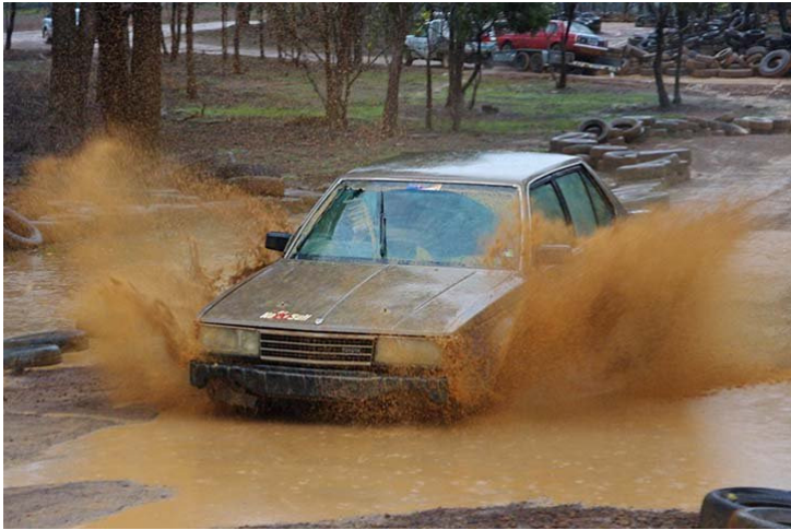
The Corona in the Lake.