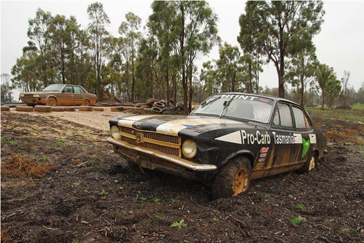
The Torana took a trip and got stuck.